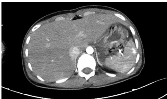
Figure 1. CT scan showing air in the stomach wall CT: Computed tomography

Ingestion of concentrated hydrogen peroxide can produce significant amounts of oxygen gas. with 30 mL of 35% solution, 3.5 L of oxygen gas can be produced. Hydrogen peroxide can be absorbed directly in the stomach wall and then released into the blood. When this amount of oxygen exceeds the maximum solubility of the blood, the risk of gas-induced hypervascularity increases, especially in the portal venous system, gastric wall, and cerebral and pulmonary vessels. Intravascular foaming can decrease the right ventricular output.